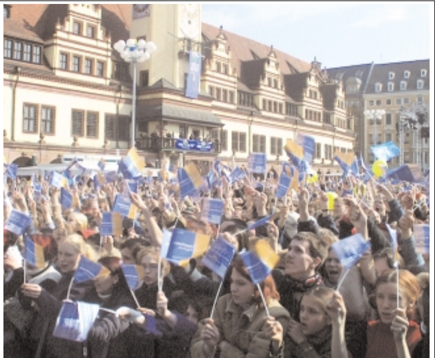
Olympic enthusiasm of Leipzig’s population!

Since April 12th 2003 the city caused national and international headlines: Together with the sailing area Rostock the city competes for the holding of the 2012 Olympic Games and the Paralympics