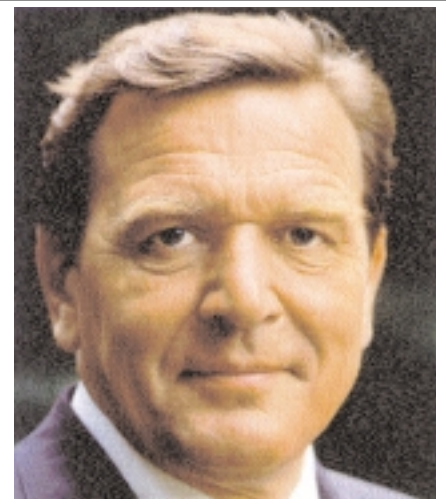
Federal Chancellor Gerhard Schröder is the patron of the Men's ECH

All responsible persons of the federation and the venues will solve their tasks carefully. This will not work out without the support of numerous honorary helpers. I want to thank all of them for their commitment. I would be happy about the support of the media and sponsors. With their commitment both of them are helping to guarantee the success of the ECH and to help volleyball make friends with a lot of people.