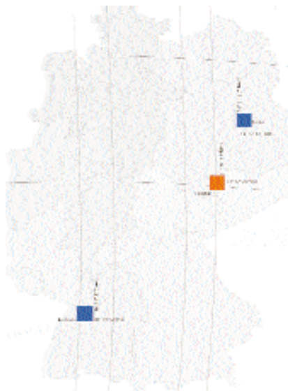
Germany and the three venues Karlsruhe, Leipzig and Berlin.