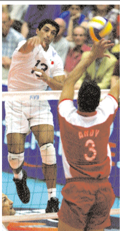
Still a "jumping wonder" and one level higher than the opponent, Andrea Giani.

One, who has experienced all the successes (3x World Champion, 3x European Champion, 7x winner of the World League) but also the "Olympic failures" in 1988, 1992, 1996 and 2000, is Andrea Giani. The already 33 years old will – as it seems – take part in the ECH in Germany, too. Italy's new national coach Montali counts, like his predecessor, on the formidable jumper Giani and appointed the universal player for the 18 players squad for the World League, which is likely to be the same for the ECH.