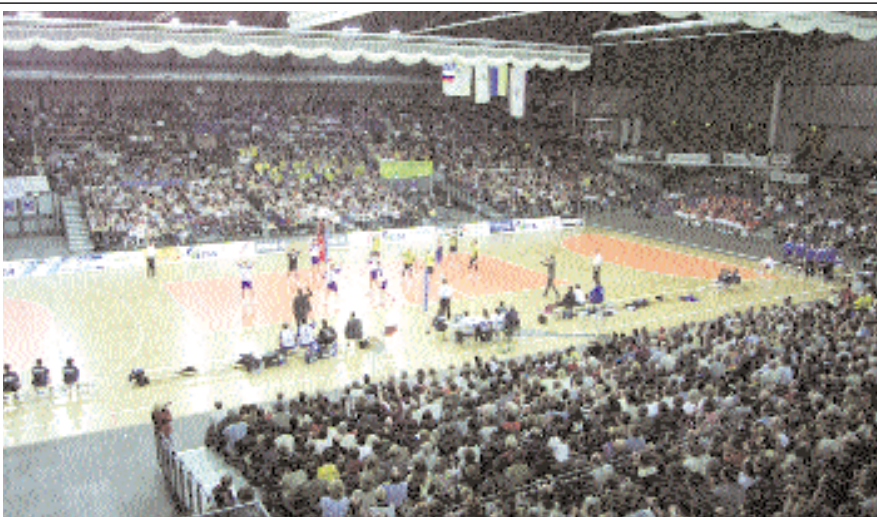
People are completely enthusiastic especially in the volleyball hall.

A lot architectural monuments concentrate in the historical city centre. Therefore the big German poet Johann Wolfgang von Goethe, who studied there, called Leipzig respectfully "little Paris". As a cultural city Leipzig is still closely linked to one name: Johann Sebastian Bach. In 1723 Bach was appointed as cantor, were he applied himself to church music and composed several of his famous opuses. During the last years Leipzig has become a city with international meaning. It radiates an innovative influence on the development of commerce, technique, science and culture.