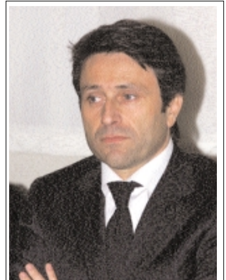
He is the hope of all Italians: coach Gian Paolo Montali.

tion to the Italians. With Alessandro Fei, Pasquale Gravina and Luigi Mistrangelo they have an outstanding good middle block and for the outside coach Montali is spoilt for choice. So, at the WCH in Argentina Andrea Giani, Samuele Papi, Christian Casoli and Luca Tencati and at the 2001 ECH even Lorenezo Bernardi, the volleyball player of the 20th century, hit on one ball.