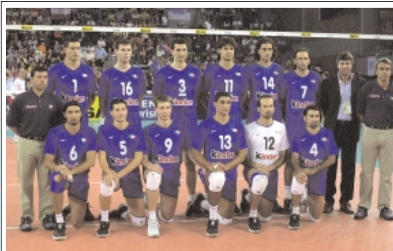
That's the way the Italian team looked at the 2002 WCH, when they only won a disappointing 5th place.

The movement to the ECH semi finals is the